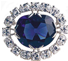
Original Cartier setting. It was hung from a chain of 45 diamonds

* He sent it registered mail in a plain brown box. See You've Got Mail in the Holiday '03 newsletter or on p. 18 of Ornamentally Incorrect .