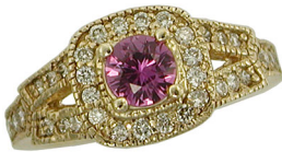
Ring in 14 karat with pink sapphire, .51 carat and diamonds, .37 carat total. $950. See it in color on the web.

Asine, ass or donkey, was the colloquial first century Latin word for a stupid person. Our word asinine is derived from it.