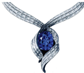
New Harry Winston setting